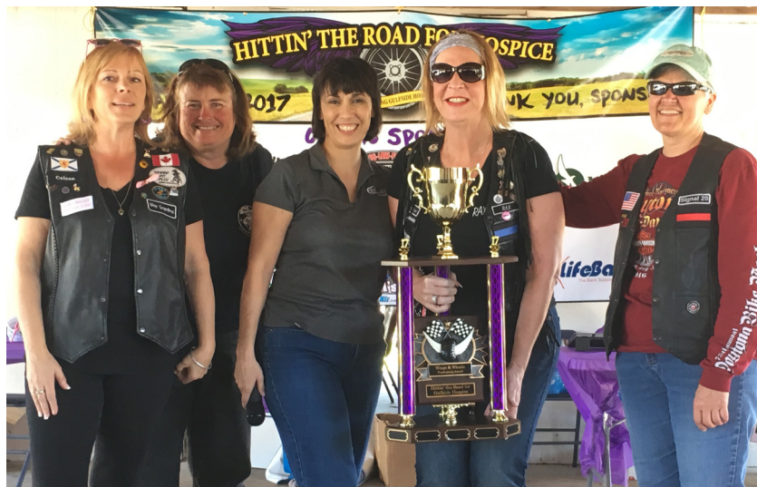
The Chrome Divas of Trinity won the Wings & Wheels Award for being the top fundraising club at the 2017 Hittin' the Road for Hospice.