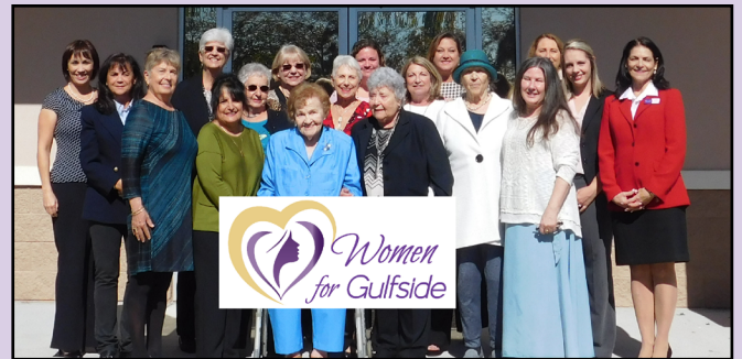
Women for Gulfside Founding Members

Join a group of dedicated women making an impact in the lives of patients and their families in our community.